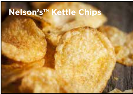
Nelson's™ Kettle Chips