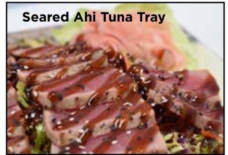
Seared Ahi Tuna Tray